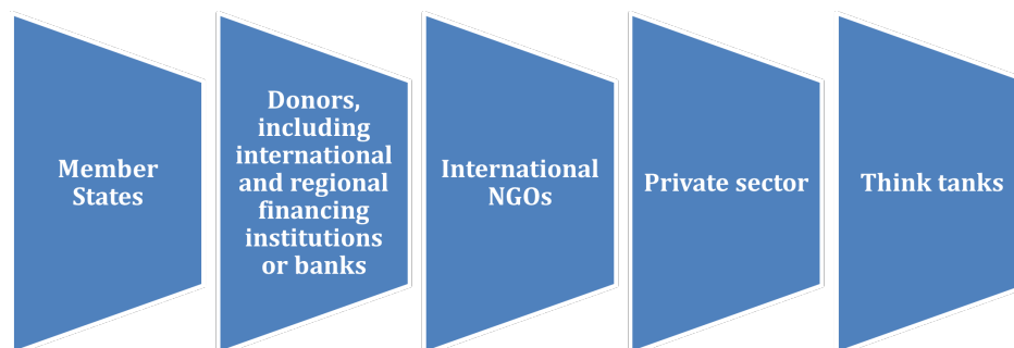
FIGURE 2: INTERNATIONAL STAKEHOLDERS IN DDR

International stakeholders are varied (see Figure 2).