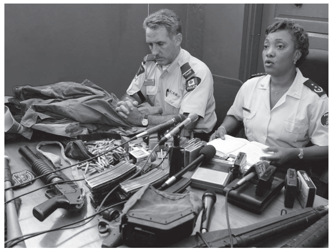
Haitian National Police (PNH) spokeswoman and UNPOL spokesman during press conference at PNH station in Delmas 33 in Port-au-Prince with weapons, ammunition and uniforms (both ex-FADH and PNH) that were seized over the weekend in two joint UNPOL–PNH operations.

A Security Council resolution provides the legal basis for the establishment of a mission. The specific tasks of the related components of such a mission are often well defined and form the basis for the concept of operations. With the deployment of UNPOL to the mission area, the UNPOL Commissioner will (depending on the size of the UNPOL component and its mandate) establish a dedicated DDR coordinating unit with a liaison officer who will work very closely with the mission's DDR command structures in order to coordinate activity with military, national police services, the UN Development Programme and other relevant agencies involved in DDR programmes.