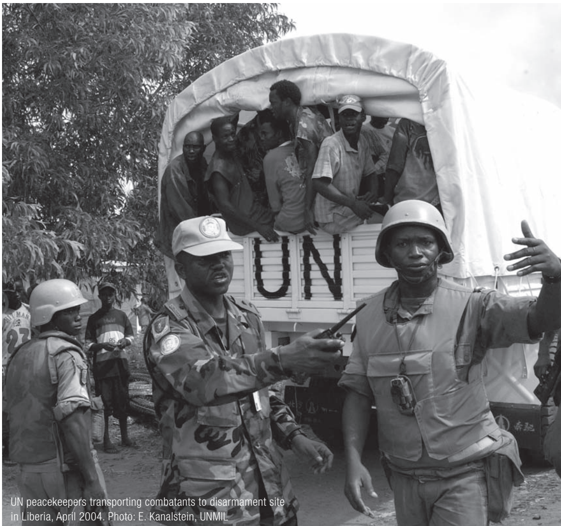
UN peacekeepers transporting combatants to disarmament site in Liberia, April 2004.

Where the military is specifically tasked with providing certain kinds of support to a DDR programme, additional military capability may be required by the military component for the duration of the task. A less ideal solution would be to reprioritize or reschedule the activities of military elements carrying out other mandated tasks. This approach can clearly have the disadvantage of degrading wider efforts to provide a secure environment, perhaps even at the expense of the security of the population at large.